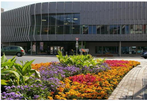
Auditory Center, University of Leoben