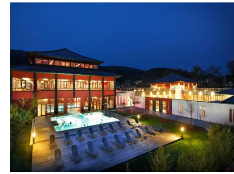
Falkensteiner Hotel & Asia Spa Leoben